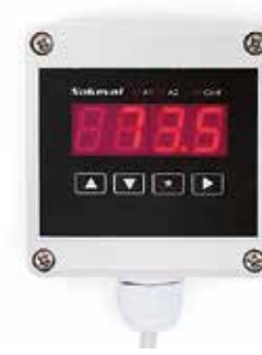
Remote display 305 – Remote digital display supplied with S300 Series Monitors (optional)

S300 Series includes the following remote models: S311, S313, S314 and S315. The remote models are used when the sensor has to be installed with the control unit up to 200 meters away. In these models, the sensor is connected to an enclosure housing the preamplifier (PA) and the amplified signal is transmitted with a 4-wire shielded cable using one of the recommended cables.